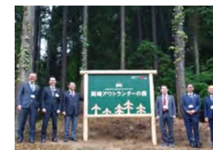
Signboard unveiling ceremony at "Okazaki Outlander Forest" (Okazaki, Aichi Prefecture)

Mitsubishi Motors (Thailand) Co., Ltd. (MMTh) and a non-profit organization, the Mitsubishi Motors Thailand Foundation (MMTF), began a reforestation project in FY2021. In 2022, as part of the "Root for Sustainability" project, we planted trees on 40 rai (6.4 hectares) of land in Nakhon Ratchasima province.