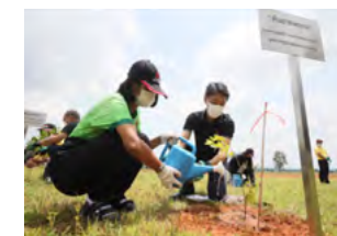
Planting trees in Thailand