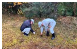
Employees clearing away invasive herbaceous plants

We are working to protect the rare white egret flower by preserving wetlands located within the plant. Employees regularly remove invasive herbaceous plants such as broomsedge bluestem and maintain the wetland environment, which gives the white egret flower room to bloom every summer.