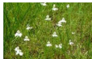
White egret flower blooming